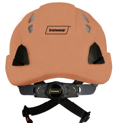
(Back with Ratchet)