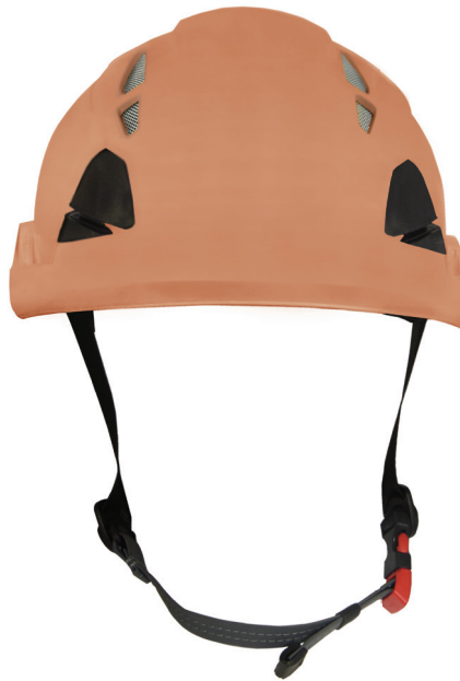
(Front with Chin Strap)